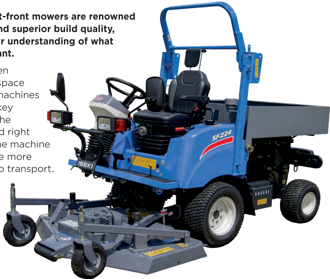
SF224 with storage box

Rotary cut and drop or rotary cut and collect, flail cut and drop or flail cut and collect, these machines truly do it all.